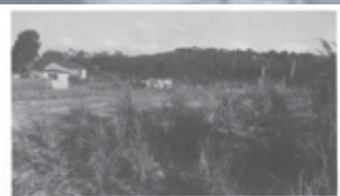
OXFORD FALLS SITE — MAY 1990 On part of proposed support facility proposed No. 1 Field