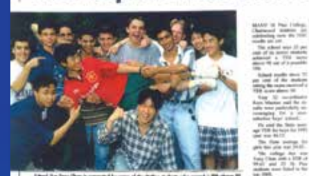
St Pius X College is proud to be one of the top schools in the state for 1993-94.