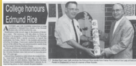
College honours Edmund Rice