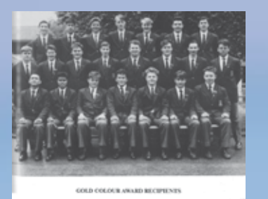
GOLD COLOUR AWARDS RECIPIENTS