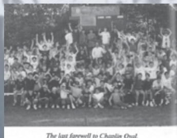
The last farewell to Chaplin Oval