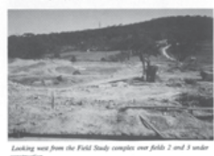
Looking west from the Field Study complex over fields 1 and 2 under