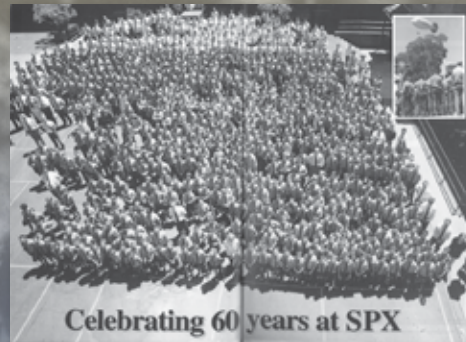
Celebrating 60 years at SPX