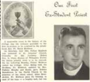
Our First Ex-Student Recruit