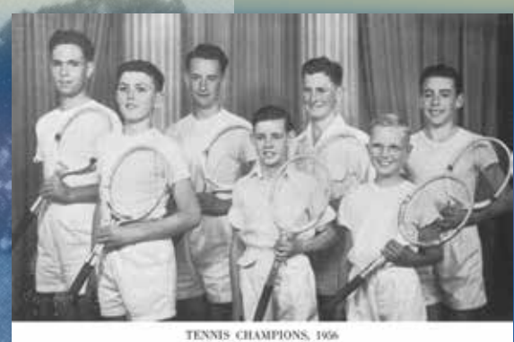
TENNIS CHAMPIONS, 1956