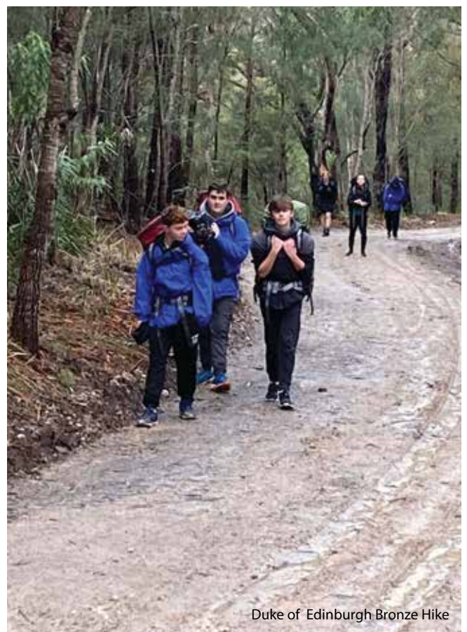
Duke of Edinburgh Bronze Hike