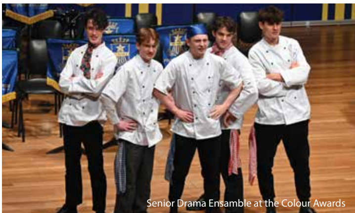
Senior Drama Ensemble at the Colour Awards