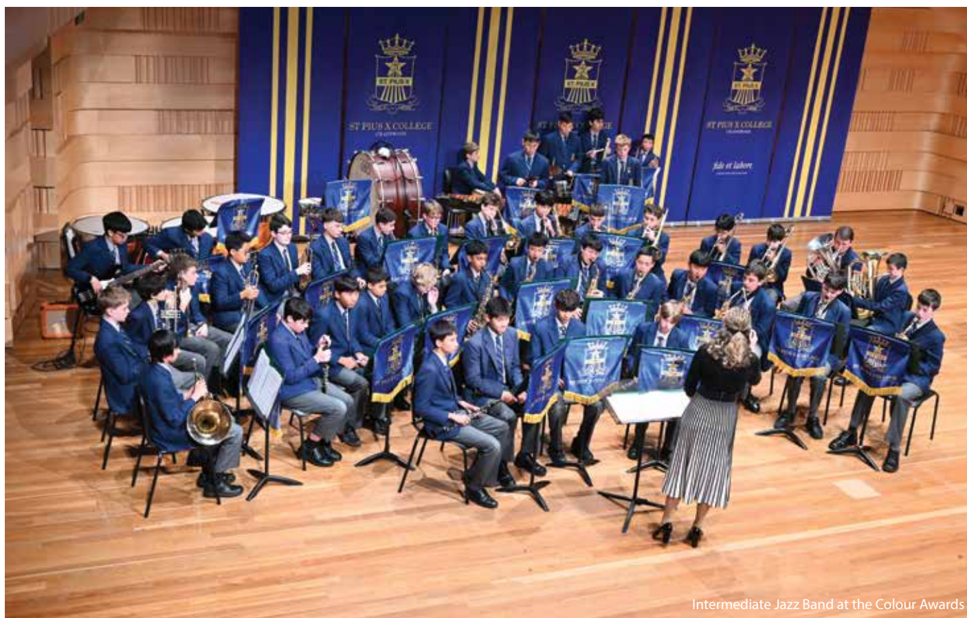
Intermediate Jazz Band at the Colour Awards