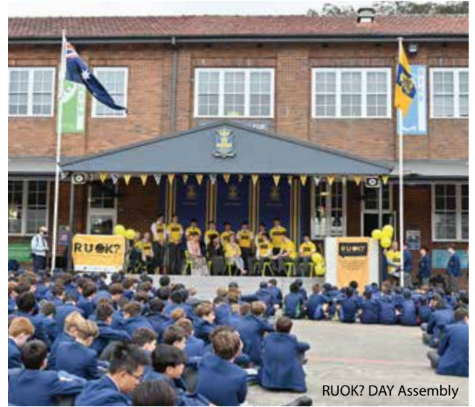
RUOK? DAY Assembly