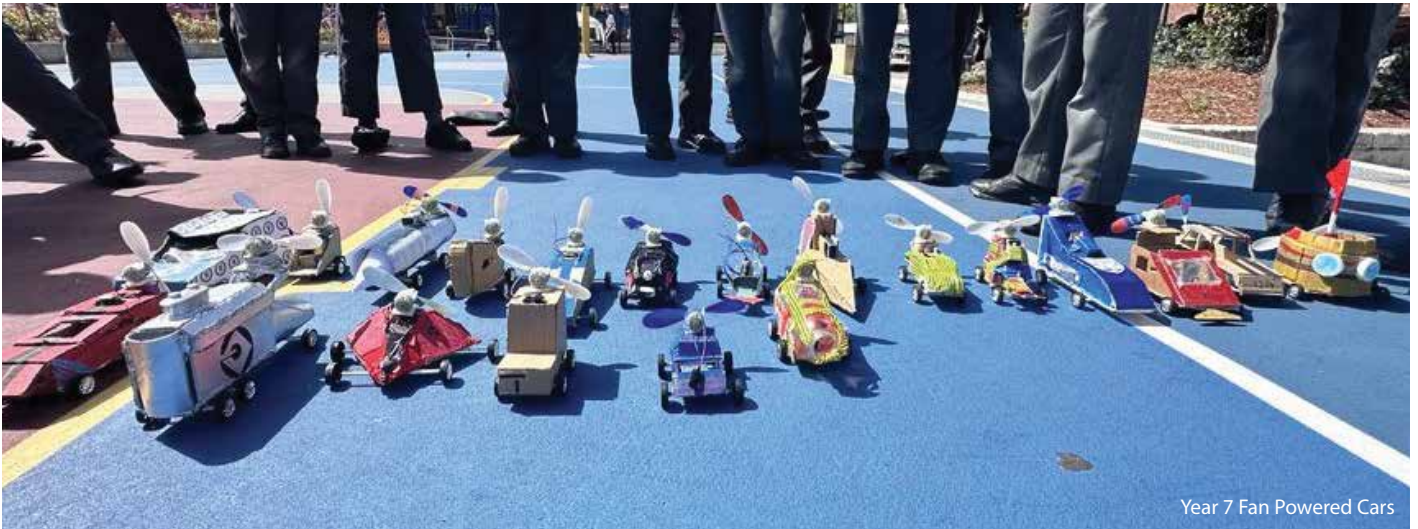
Year 7 Fan Powered Cars