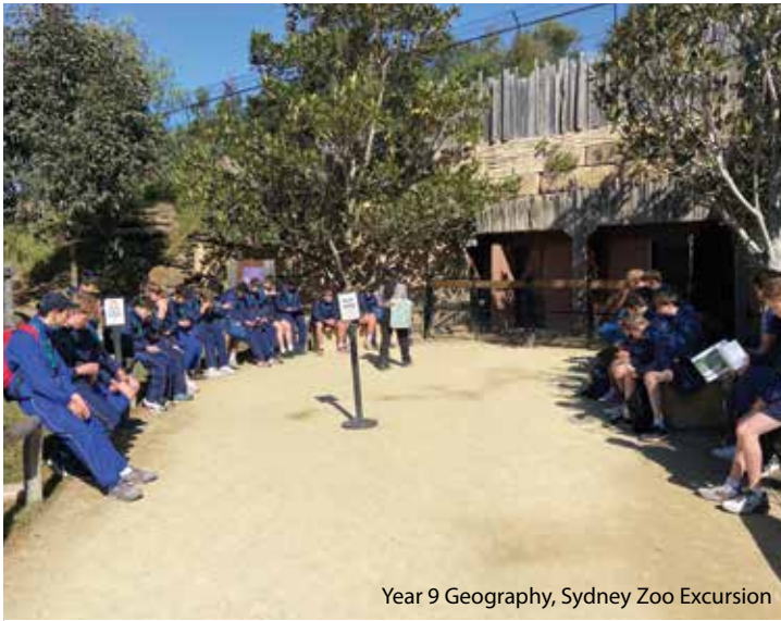
Year 9 Geography, Sydney Zoo Excursion