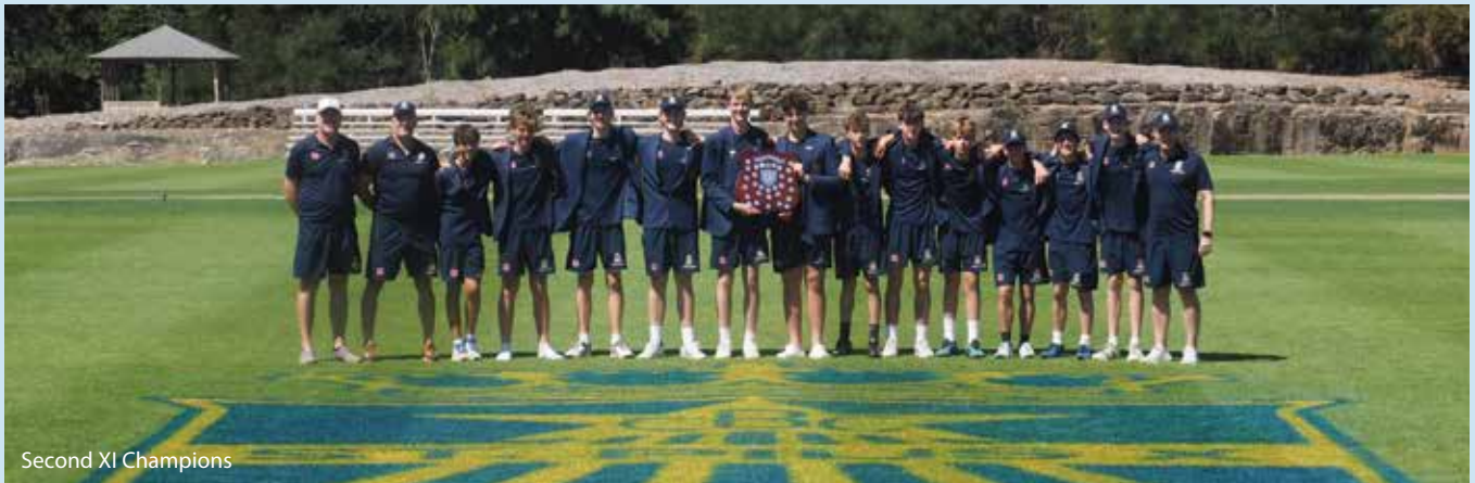
Second XI Champions