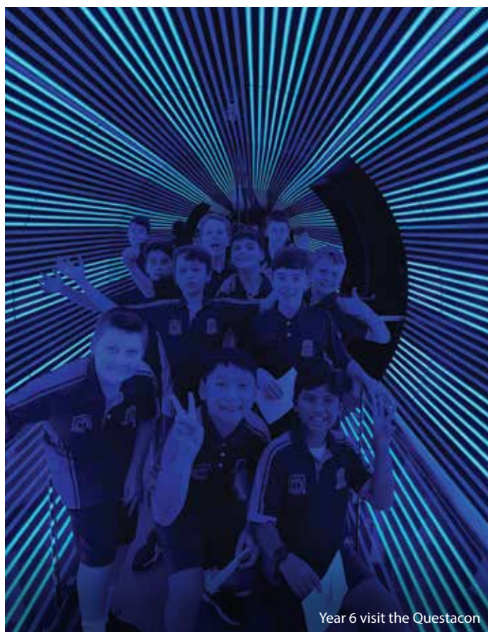
Year 6 visit the Questacon