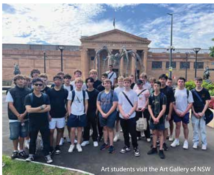
Art students visit the Art Gallery of NSW