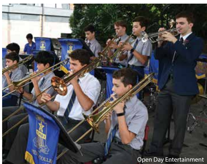
Open Day Entertainment