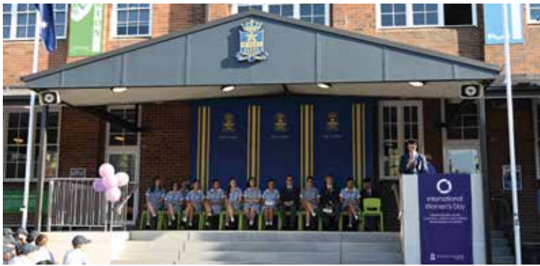
Visitors from Mercy College