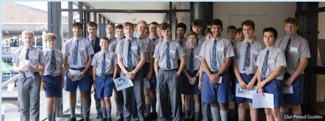
Our Proud Guides