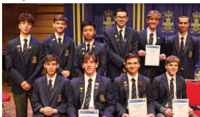
Year 12 Maths Accelerants who achieved Band 6 in the 2023 HSC