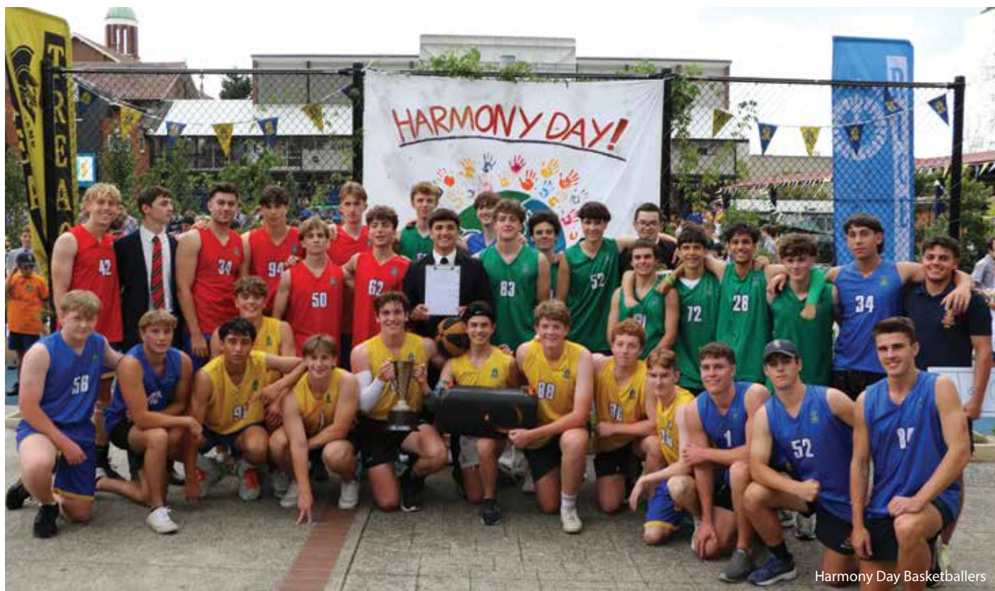
Harmony Day Basketballers