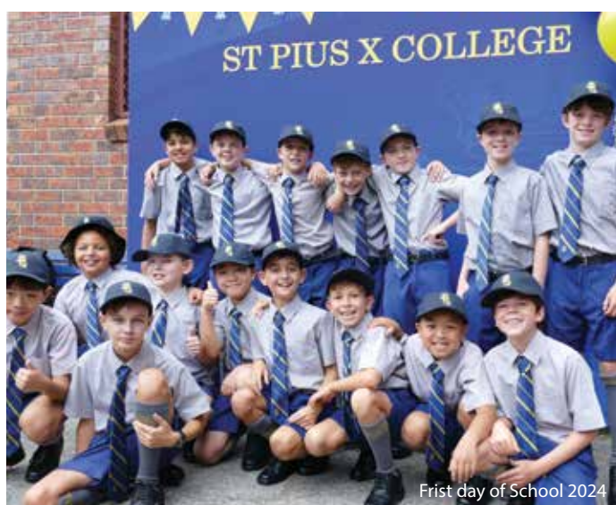
First day of School 2024