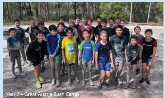
Year 7 – Great Aussie Bush Camp

Year 7 attended Great Aussie Bush Camp in Tea Gardens during March. This 2-night, 3-day experience provided the cohort the opportunity to make new friends, develop leadership and teamwork, overcome fear and adversity as they push outside their comfort zones all whilst having a lot of fun! This further cemented their pastoral year theme of 'belonging to a community'.