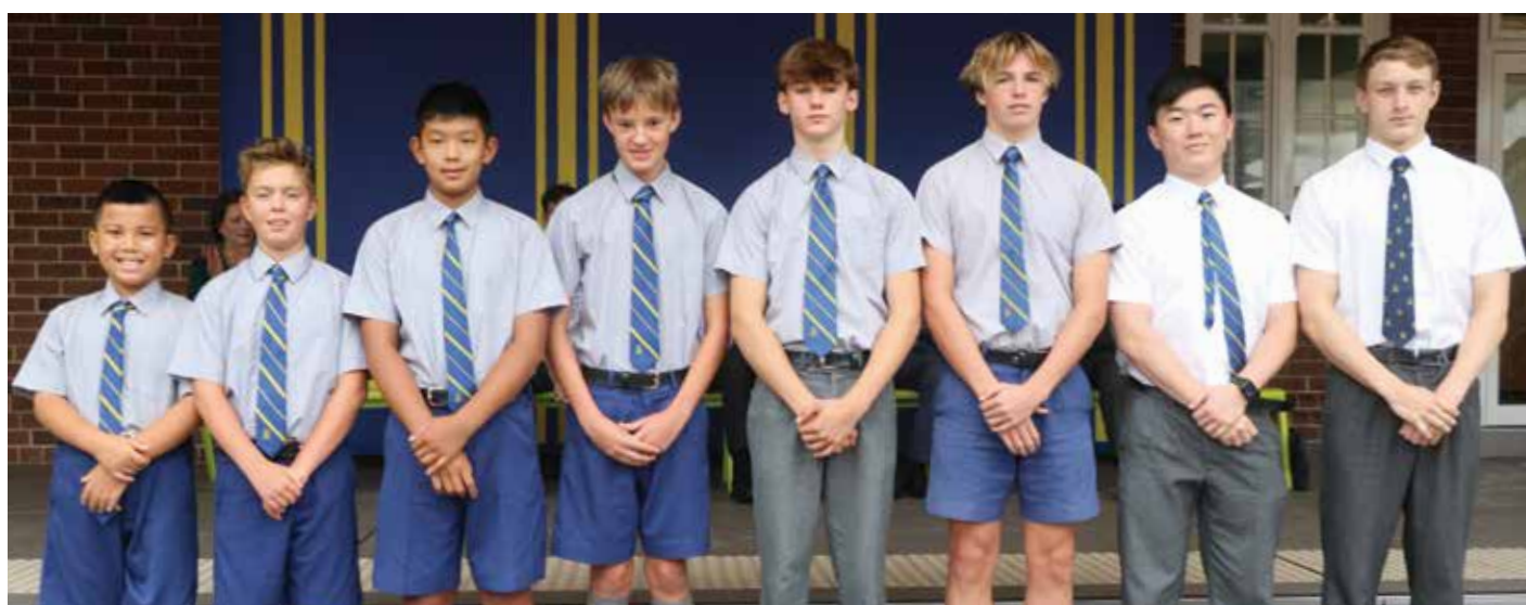
Swimming Age Champions