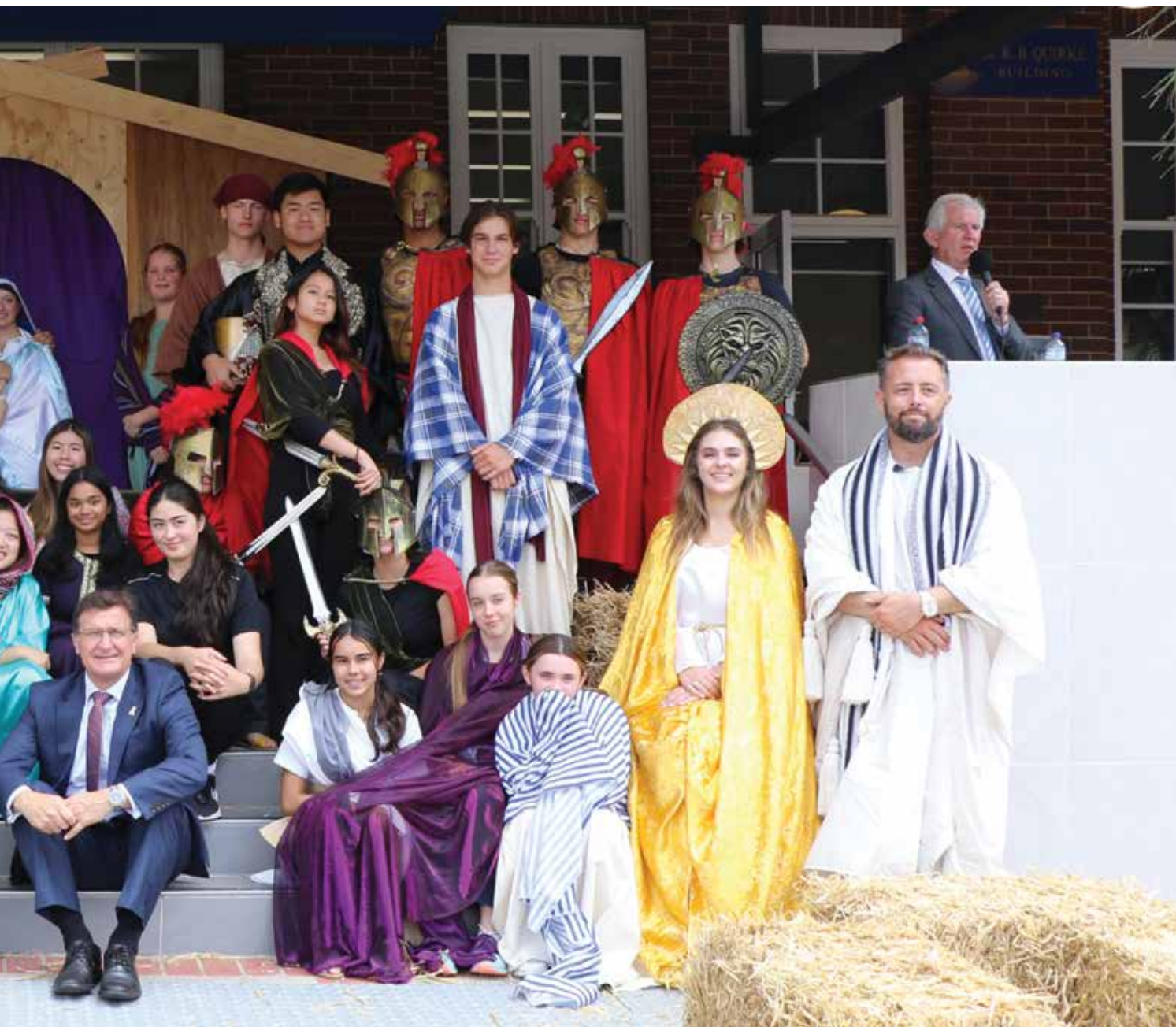
Road to Bethlehem

Our annual Open Day was also a very proud opportunity to showcase the many aspects of College life. Our students were our best ambassadors, displaying their great enthusiasm for their school as they guided visitors, demonstrated science experiments or performed musical numbers. It was a great occasion that represents all that is great about St Pius X.