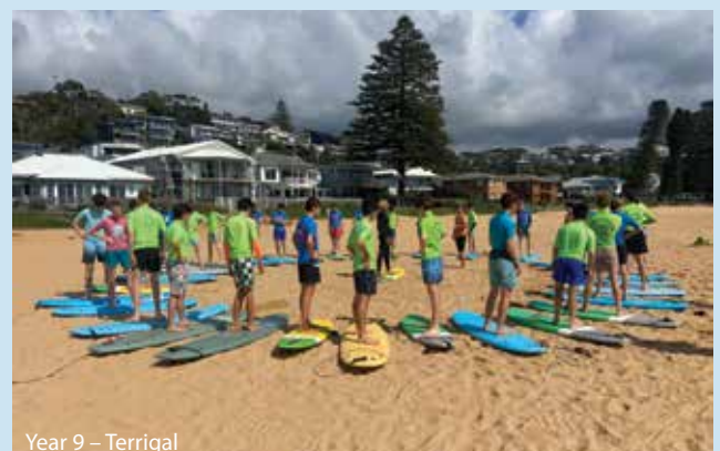
Year 9 – Terrigal

The students had the opportunity to challenge by choice, such as stand up paddle board, surf lessons and coastal bushwalks as well as exploring Aboriginal heritage, history and culture.