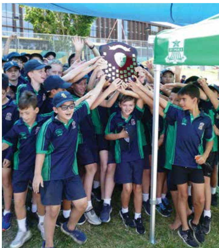
Junior School Swimming Carnival winners, Purton House