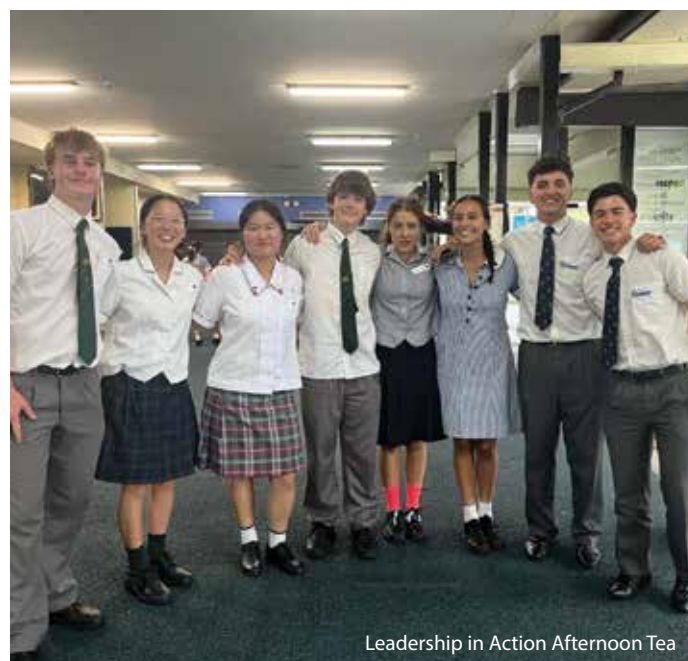
Leadership in Action Afternoon Tea