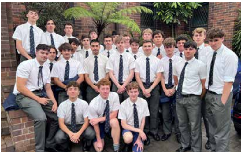
Senior School "Mo-Bros"

It was fantastic to see so many staff and students getting behind Movember. The College community raised $4,696. The senior students were, for the first time, allowed to participate in the growing of moustaches which provided some fun and competition along the way.