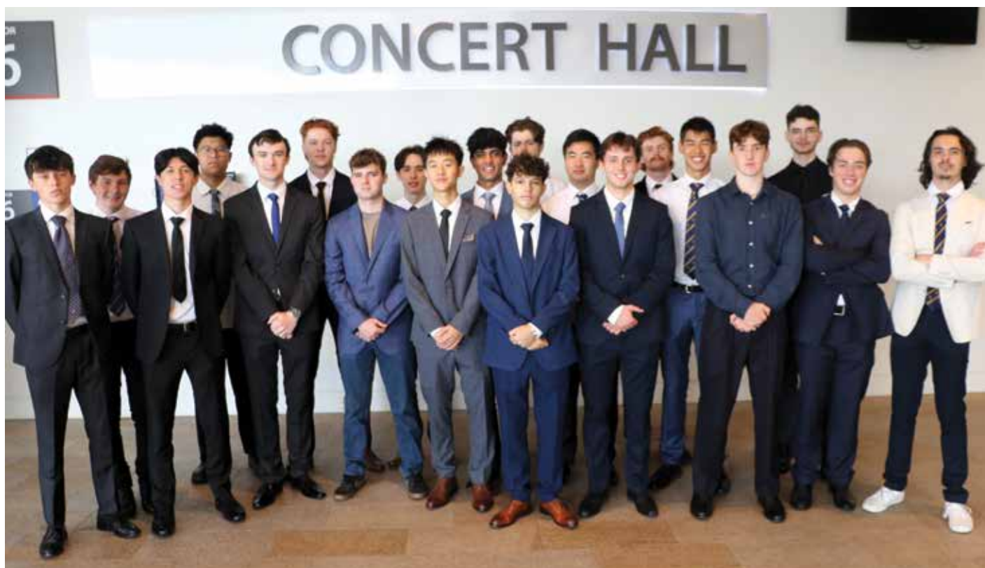
2023 High Achievers