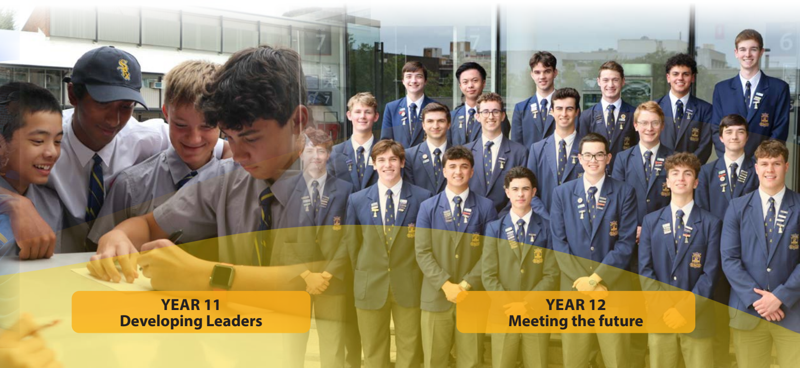
YEAR 11 Developing Leaders

Peaceful Kids program Mindfulness initiatives and training College counselling Learning support Careers Advice and Support Occupational Therapy Support Celebration days: • R U OK? Day • Reconciliation Week • Naidoc Week • National Day of Action against Bullying and Violence • Harmony Week • Founders Day Festival • Remembrance Day • Mother's and Father's Day