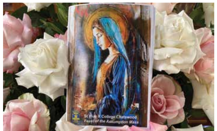
Left Junior School Assumption Mass Top right Mother's Day celebrations Bottom right Feast of the Assumption Mass Booklet