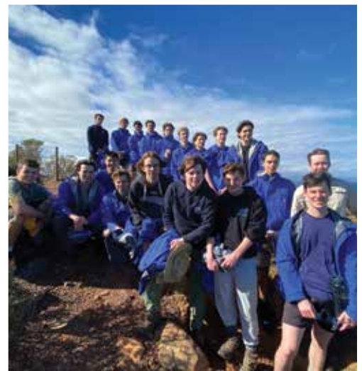
Top left Proudly supporting Jersey Day Top right Year 12 student leaders decorating the school for R U OK? Day Bottom left Year 8 Ski trip Bottom right One of the Year 12 retreats