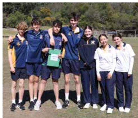
Left Year 12 St Pius X and Mercy College Trivia Evening Top Students and staff during the Red Dirt Immersion Bottom middle Year 12 St Pius X v Mercy College Netball game Bottom right St Pius X and Mercy College Year 9 students