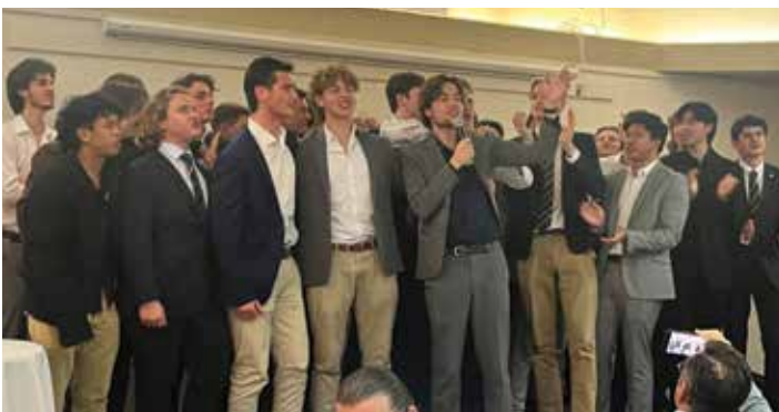
2022 students enjoying their first Old Boy's Dinner