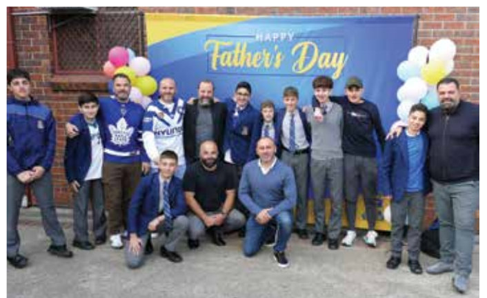
Left St Pius X Day Top right Youth Mass at Our Lady of Dolours Parish Church Bottom right Father's Day celebrations