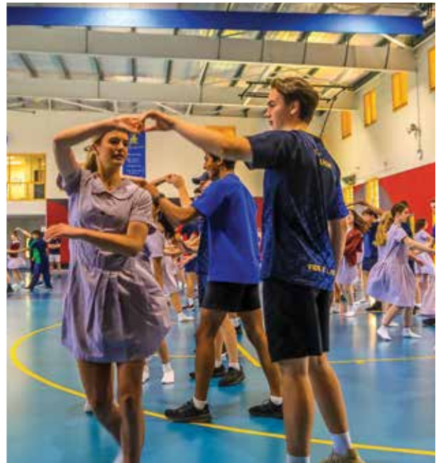
Top left Year 5 Camp. Top right Year 7 Camp. Bottom left Year 6 Canberra trip. Bottom right Year 9 Ceroc Dance Workshop with Year 9 Brigidine College.