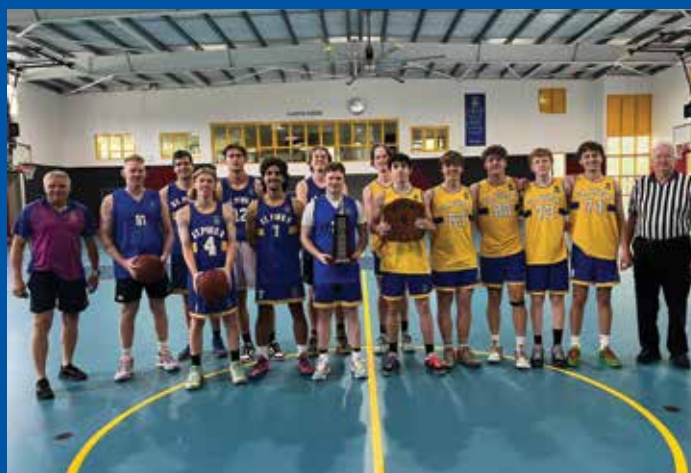
Old Boys Gala Day Basketball Teams.