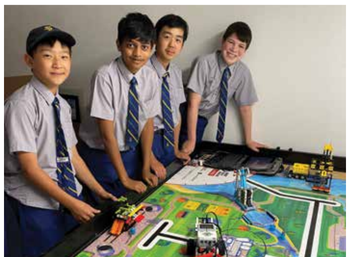
Top Diverse Learning team. Second Science Club. Third Chinese Club members celebrating Lunar New Year. Bottom Junior Robotics Club members.