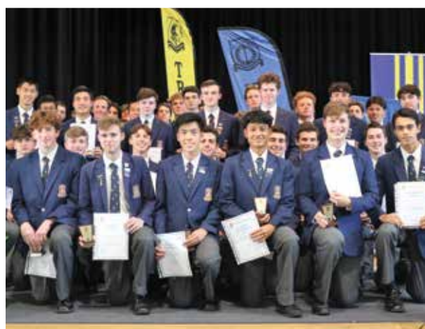
Top 2022 Scholarship Recipients. Middle Year 9 2022 Academic Award Recipients. Bottom Year 11 2022 Academic Award Recipients.