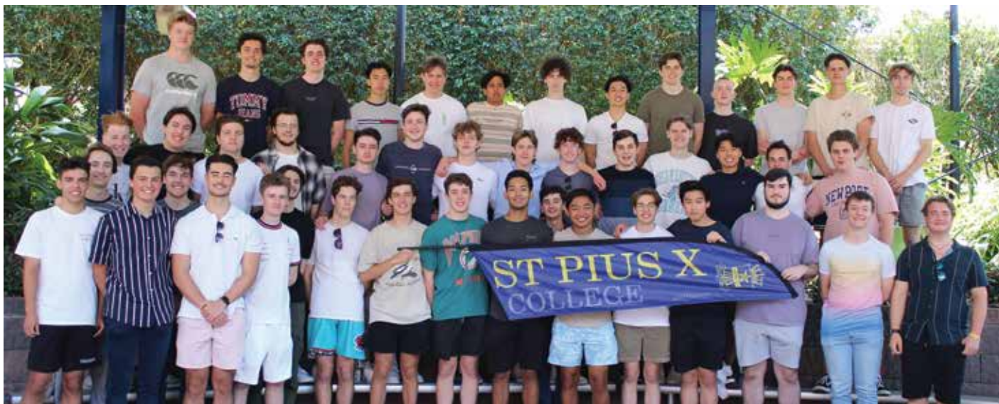
Class of 2022 at the HSC Results BBQ