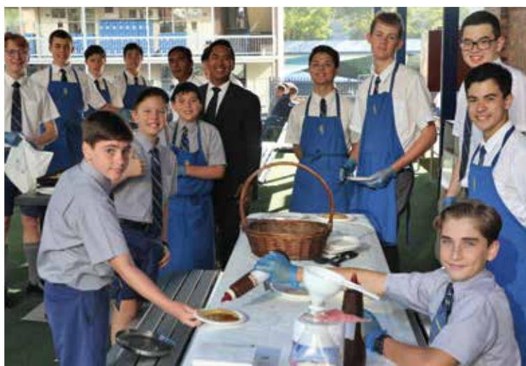
Top left Year 5 and 6 Students receiving their Bibles. Top right Edmund Rice Society members supporting Project Compassion. Middle The College Lenten banner. Bottom left Receiving Ashes at the Ash Wednesday Liturgy. Bottom right The College Edmund Rice Society selling pancakes for Project Compassion.