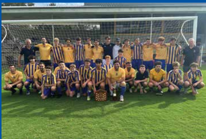
Old Boys Gala Day Football Teams.