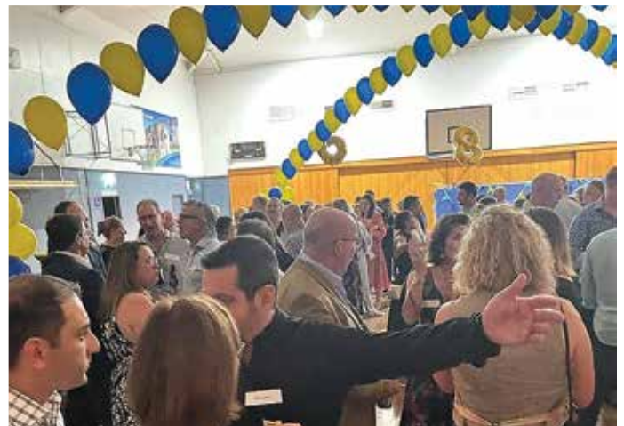
Top Right Some of the P&F helpers during Open Day. Bottom Left P&F helpers at Founder's Day. Bottom Right P&F Cocktail Party.