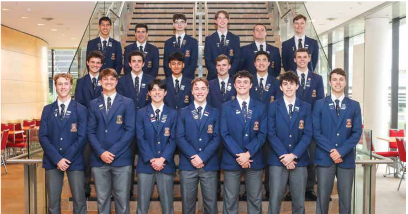
2023 Student Leadership Team