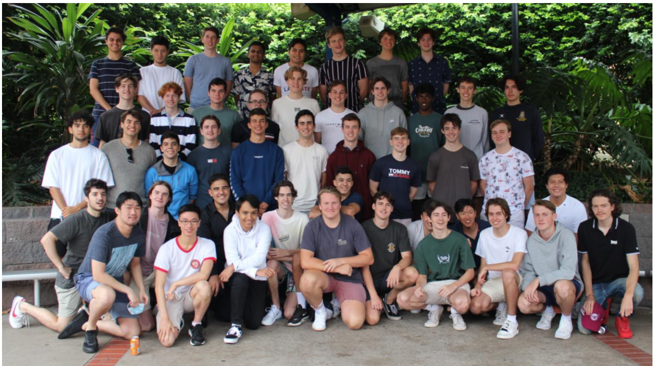
2St Pius X College HSC 2021 students