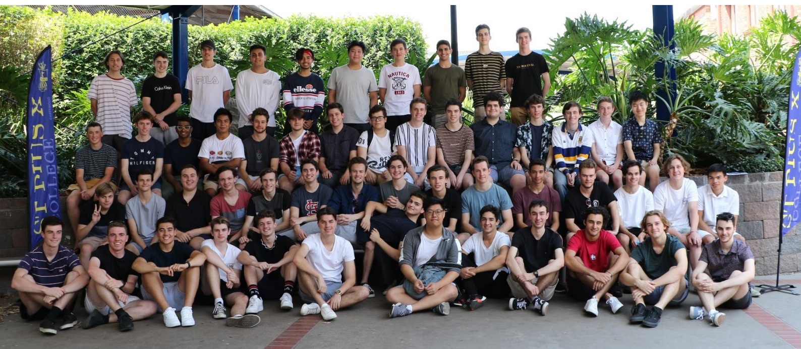
2019 HSC students at ATAR BBQ 17/12/2019