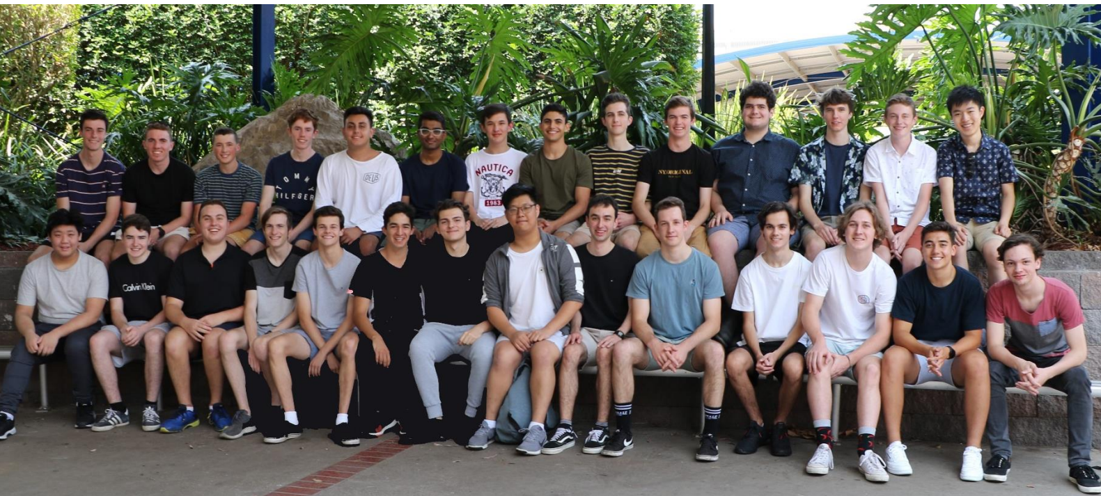
Just some of the 2019 HSC students who achieved ATAR's over 90