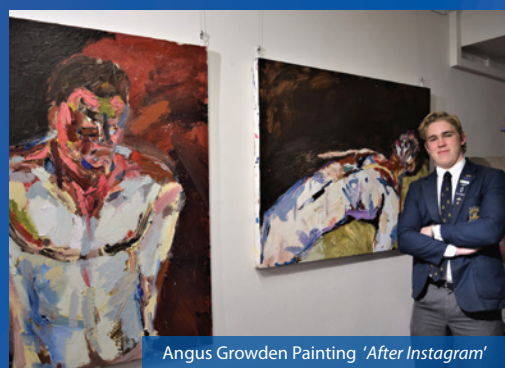
Angus Growden Painting 'After Instagram'