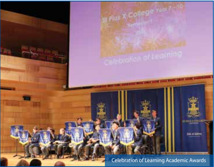
Celebration of Learning Academic Awards