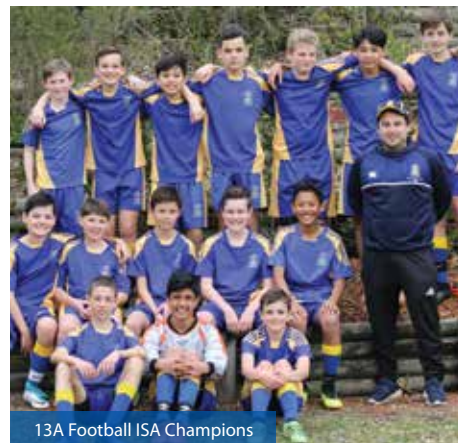
13A Football ISA Champions

Congratulations to the mighty 13A ISA Champions! The team did the College and themselves proud with a convincing 2-0 victory over Redlands. Commiserations to the 13B, 14C, 14A, 15B and 2nd XI who were all valiant in defeat.