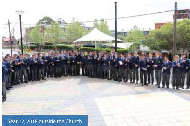
Year 12, 2018 outside the Church