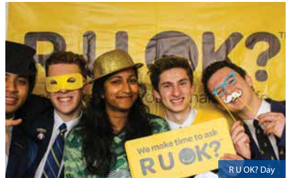
R U OK? Day

Students were invited to put on a Jersey to be worn for the day and donate a gold coin to R U OK? Charities such as Lifeline and The Black Dog Institute.