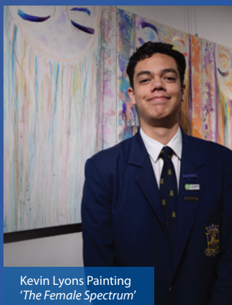
Kevin Lyons Painting 'The Female Spectrum'