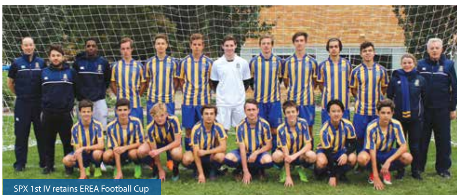
SPX 1st IV retains EREA Football Cup