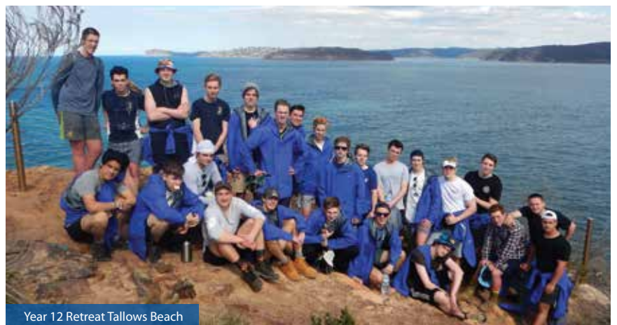
Year 12 Retreat Tallows Beach