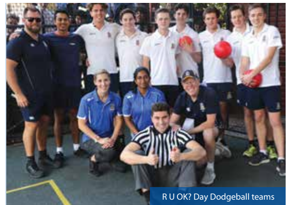
R U OK? Day Dodgeball teams