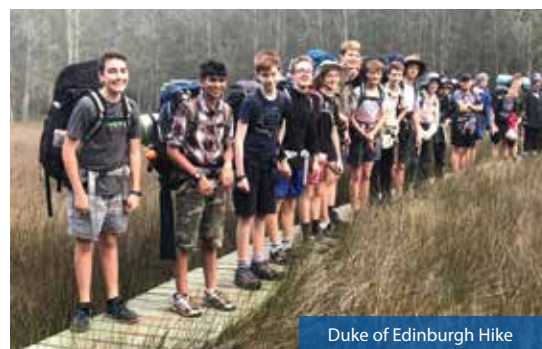
Duke of Edinburgh Hike

Year 12 who have recently completed their Gold Awards and will have these presented by the Governor of NSW at a reception at Government House.