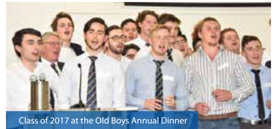
Class of 2017 at the Old Boys Annual Dinner