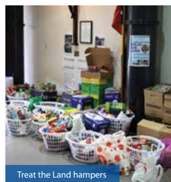
Treat the Land hampers