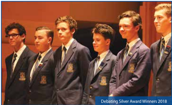
Debating Silver Award Winners 2018

During the year, Blue Awards were also presented across Years 7-12 at school assemblies.