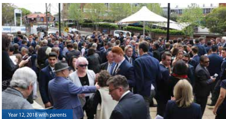
Year 12, 2018 with parents