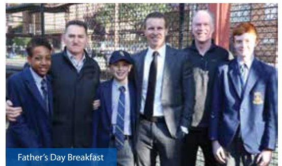
Father's Day Breakfast