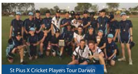
St Pius X Cricket Players Tour Darwin