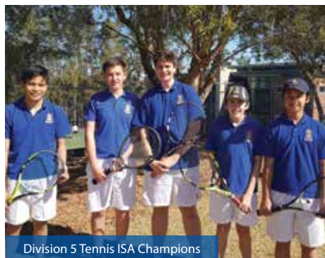
Division 5 Tennis ISA Champions