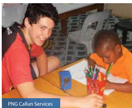
PNG Callun Services

alive in our recent efforts to support the families of our drought stricken farmers. The College has successfully raised over $30,000 through the Drought Relief Jewellery Raffle. In addition the College has collected and delivered a truck load of 'Treat the Land' hampers to NSW farming families in need. The College is working with Coonabarabran High School and St Vincent de Paul to distribute the raffle money and hampers to families in the district, and is ensuring that the whole community benefits by including vouchers for local businesses in the hampers. The partnership we are building with Coonabarabran High School provides valuable experiences for our students, and will be a focus at the annual Founders Day Festival in November where the theme will be Resilience and the Land. We thank Bowerhaus Jewellery for their generous jewellery donation as well as the entire community for their support in selling raffle tickets and making donations of goods.