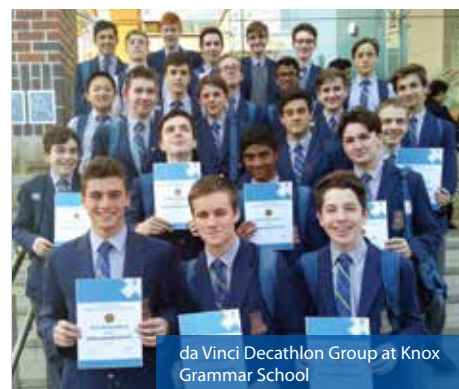
da Vinci Decathlon Group at Knox Grammar School