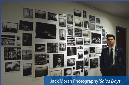
'Salad Days'