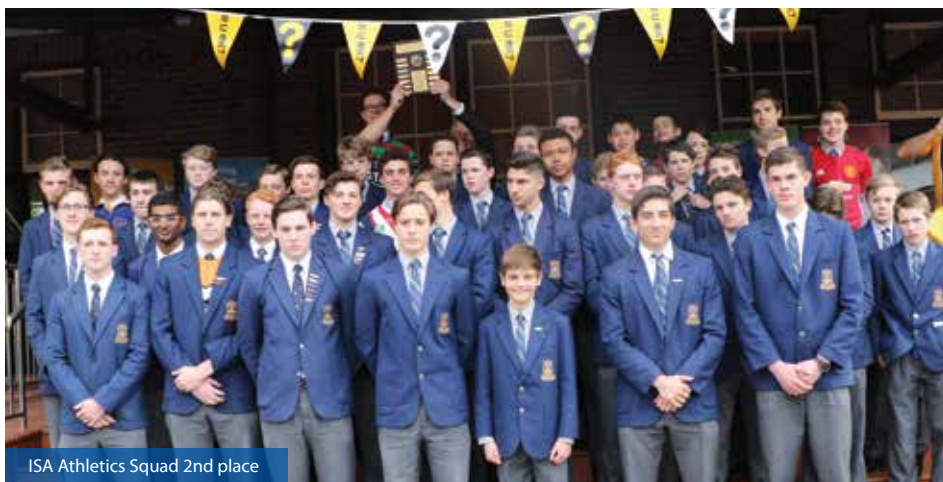
ISA Athletics Squad 2nd place