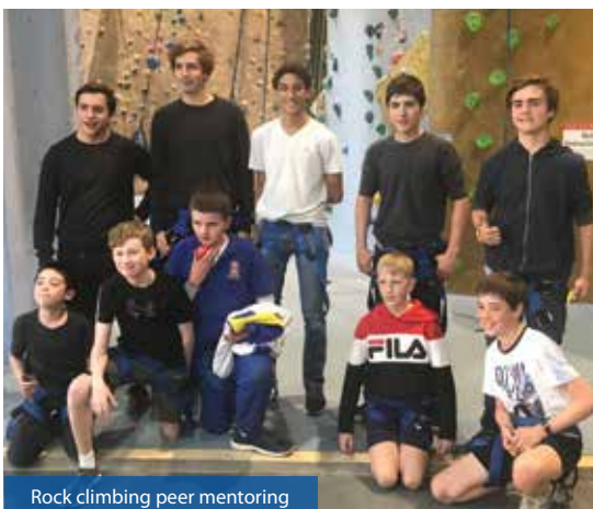
Rock climbing peer mentoring