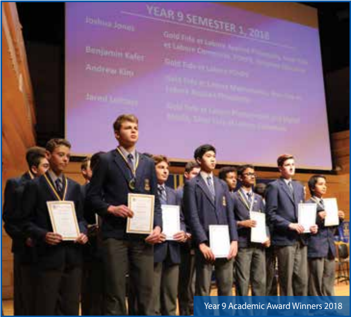
Year 9 Academic Award Winners 2018

A total of ninety two Awards were presented at the Co-Curricular Colour Award Ceremony held at the Concourse on Monday 10th September. The Awards were presented to Year 11 and Year 12 students for achievement and participation in all aspects of Sport or other Co-curricular activities.