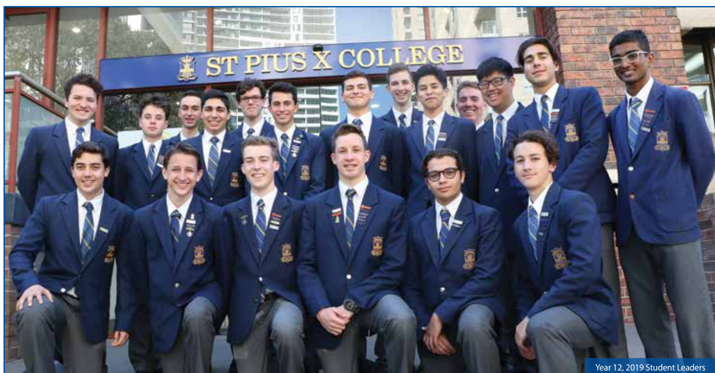
Year 12, 2019 Student Leaders