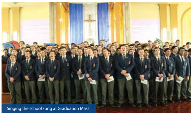
Singing the school song at Graduation Mass