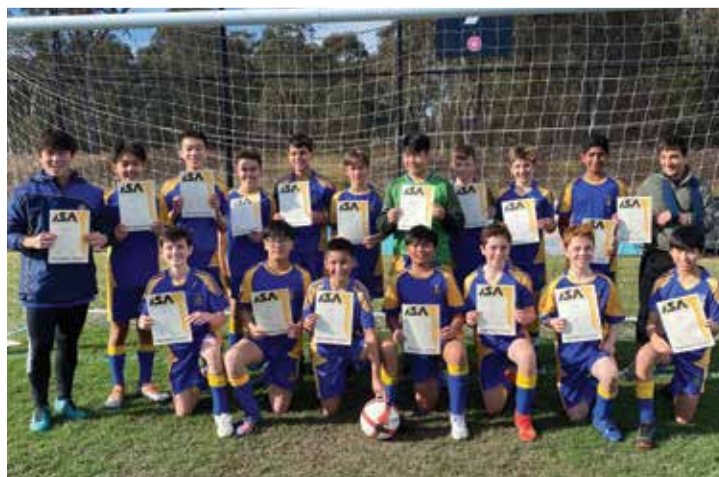
Top left Senior Athletics Carnival. Top right St Pius X College 1st Rugby at the Ross Fagan Shield against St Aloysius'. Bottom left ISA Cross Country team. Bottom right 13B Grand final winners.