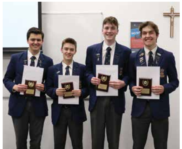
CSDA Debating Finalists