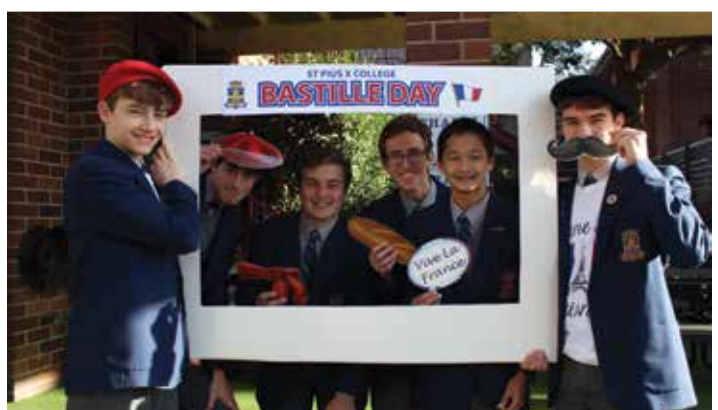
Top Team Jezza's Mexicano during Market Day. Second Students enjoying Science Week Activities. Third Australian History Competition Awardees. Fourth Australian Geography Competition Awardees. Bottom Bastille Day Festivities.