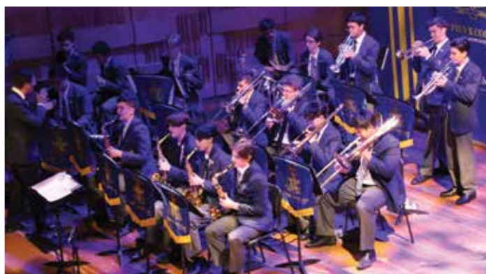
Top Major Colour Awardees. Bottom Senior Jazz Band.