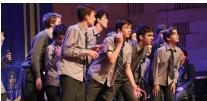
Top Academic Awards Ceremony Official Party. Middle Awardees. Bottom Year 10 Drama presentation.