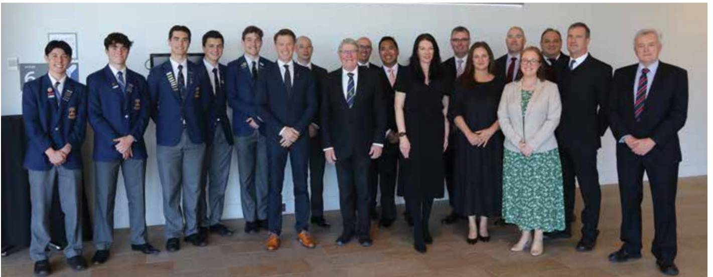
Top Class of 2022. Bottom Year 12 Internal Graduation Official Party.