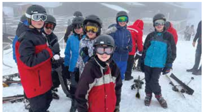
Top Year 9 St Pius X College and Mercy Catholic College students at Oxford Falls. Bottom left Year 12 students and teachers getting into the spirit of R U OK? Day and Jersey Day. Bottom right Year 8 ski trip.