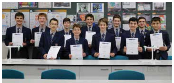
Top left Year 8 da Vinci Decathlon team. Top right Year 10 students at the Sydney Writers Festival. Bottom left Literature Awardees. Bottom right Big Science Competition High Distinction Award Winners.